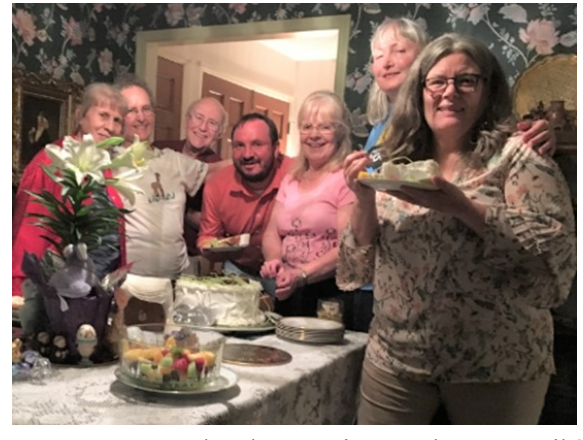
Dessert, Partner Church Committee Welcome, April 3