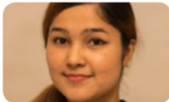
Wai Wai is helping prevent violence and bridge ethnic and religious divides in Burma.