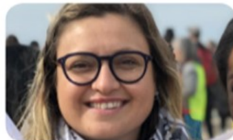
In Mexico and the U.S., Monica is using the arts to bolster resiliency and leadership among migrants.

Please check our website for new events posted almost daily: